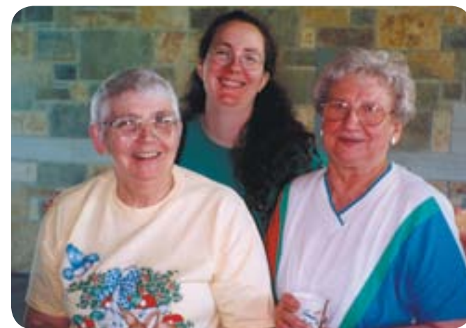
Winter 1: January 2 - February 26, 2012