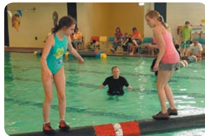
Winter 2: February 27 - April 22, 2012